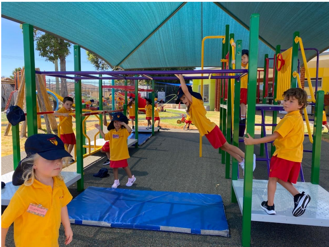
Our 'Pre Primary' enjoying the playground