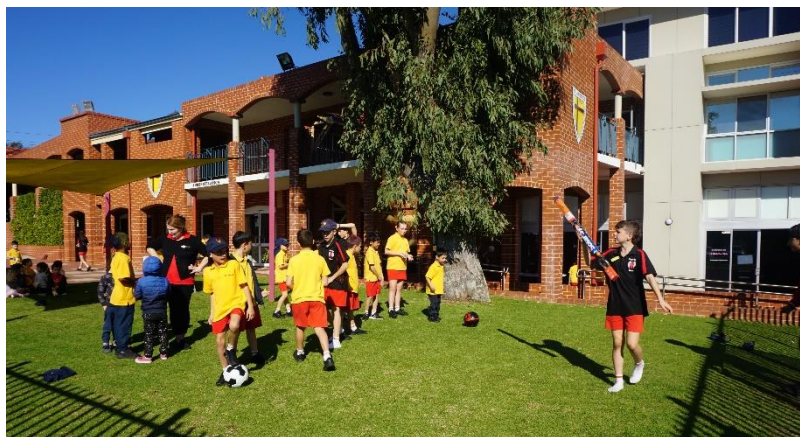
Tabloid Sports – St Lawrence Feast Day

I ask you to keep in your prayers all the boys and girls who across our world are not accessing a suitable standard of education. Who for no fault of their own are unable to learn to read and write. I pray we may find a solution to this crisis and heal the gap growing between those who can and those who cannot.